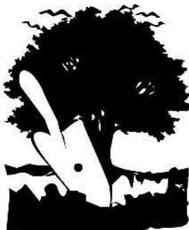
Mustard Seed Faith

Copyright © Sermons4Kids, Inc. May be reproduced for Ministry Use